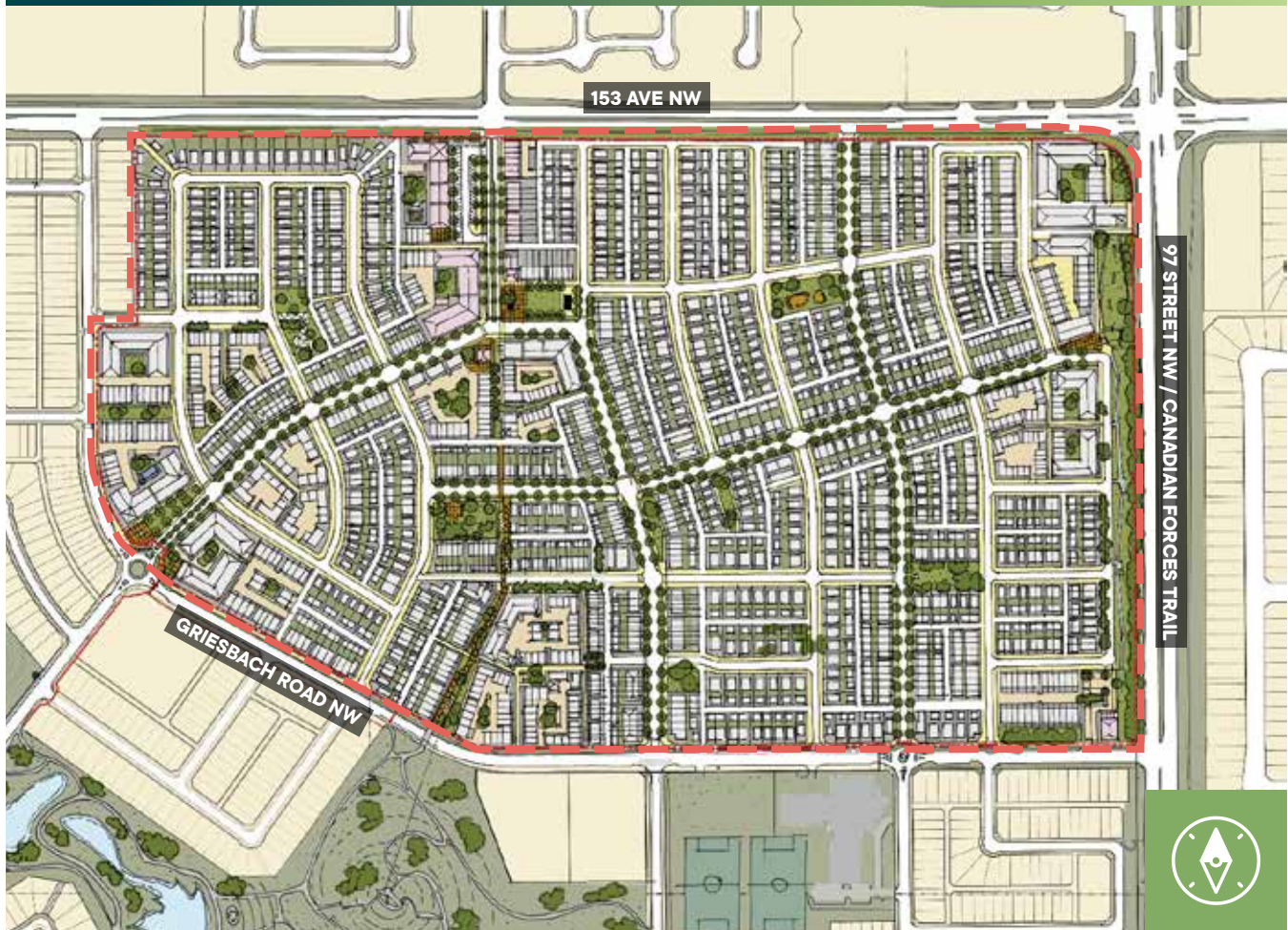
FIGURE 2: ILLUSTRATIVE MASTER PLAN